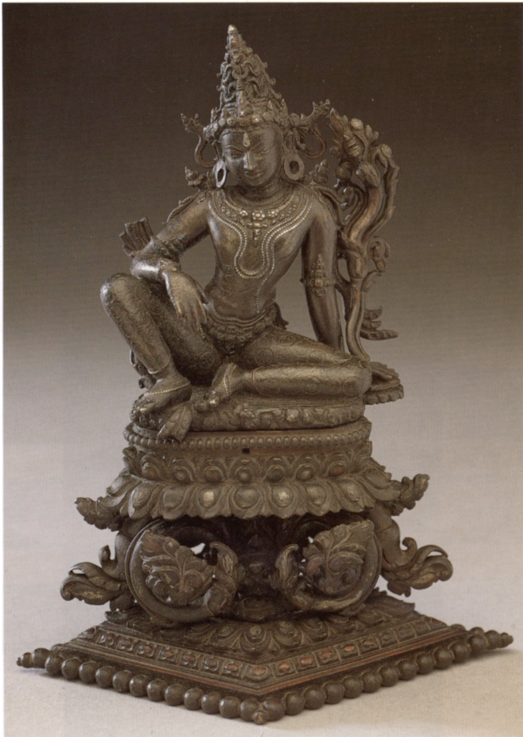
49. Maitreya Bodhisattva. Probably India, Bihar. Ca. twelfth century.